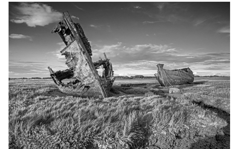
Photograph by Ian McGill